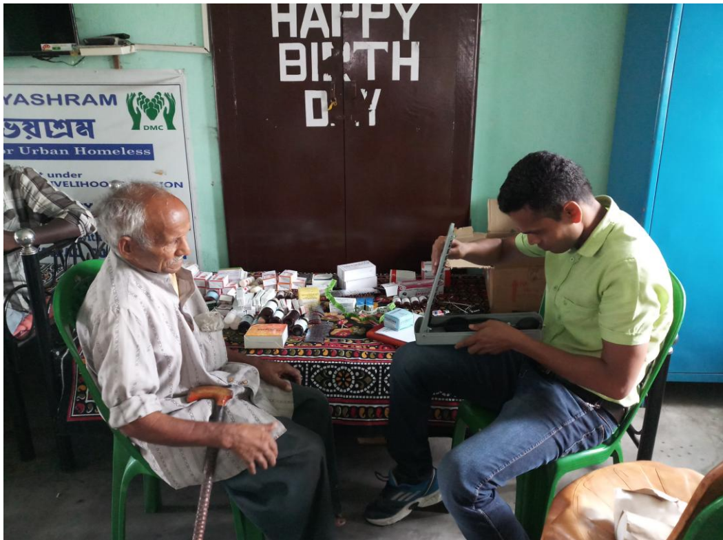
Health Checkup of Inmates of Abhayashram