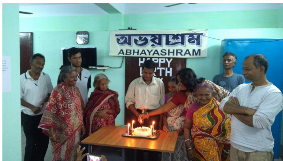
Celebration Of Birth day