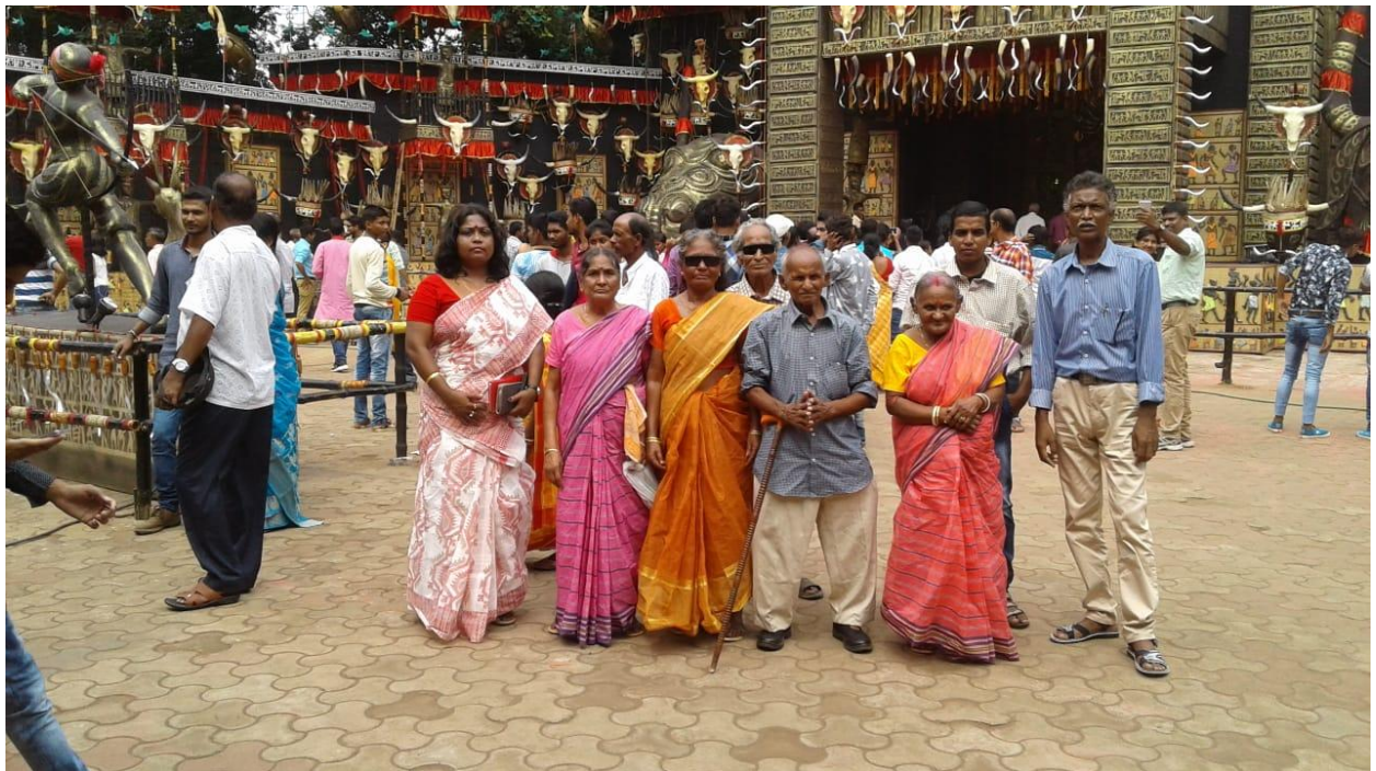
Durgapuja pandal hopping with the inmates of Abhayasharm