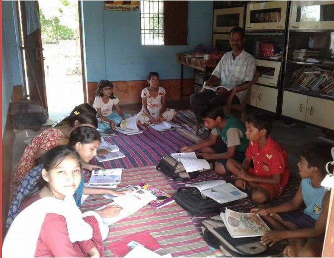
The students coaching Class on progress