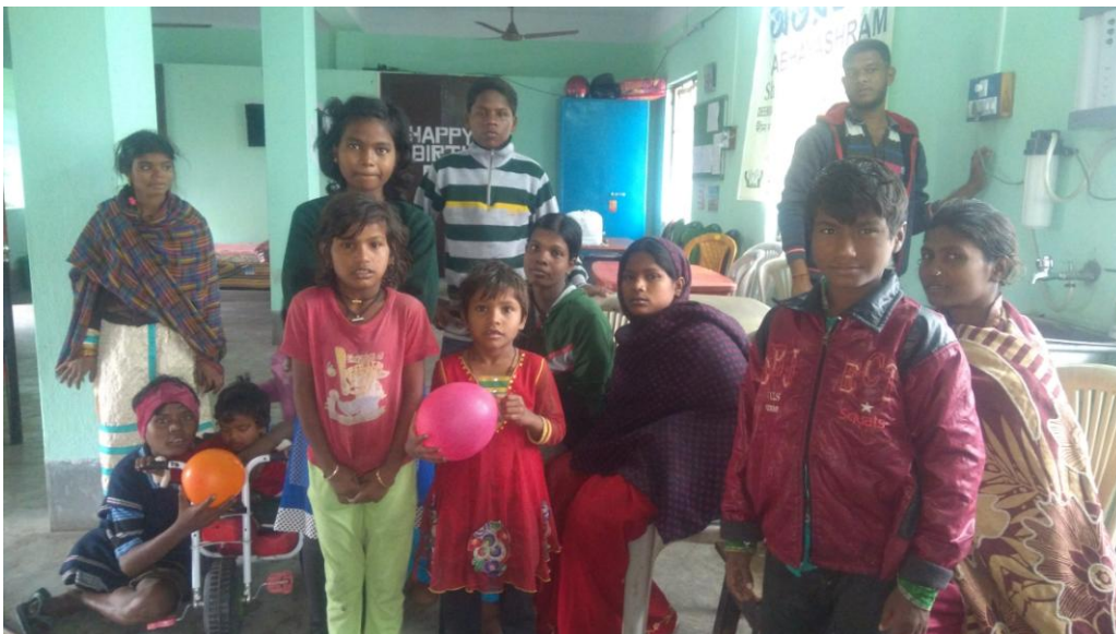
THE CHILDREN OF ABHAYASHRAM

Help community to establish ideal village & common development activities.