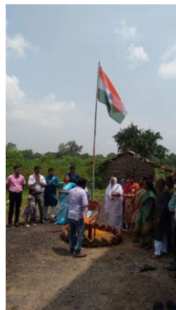
Hoisting National Flag