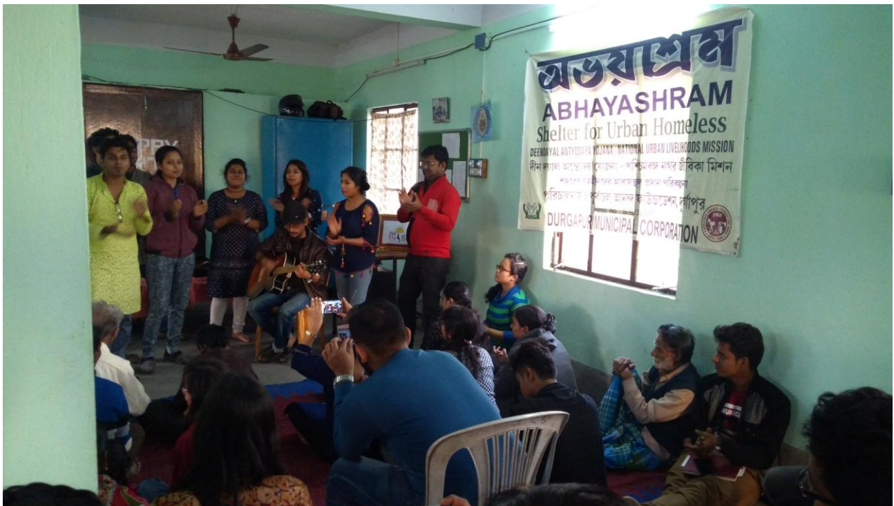
A cultural programme by local youths at the Abhayashram

Now it is time to Pay back something to the society Join us as volunteers to contribute your skill ..