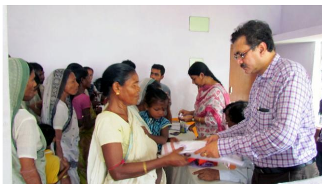
Distribution of new sarees to the community mothers as Relief Programme