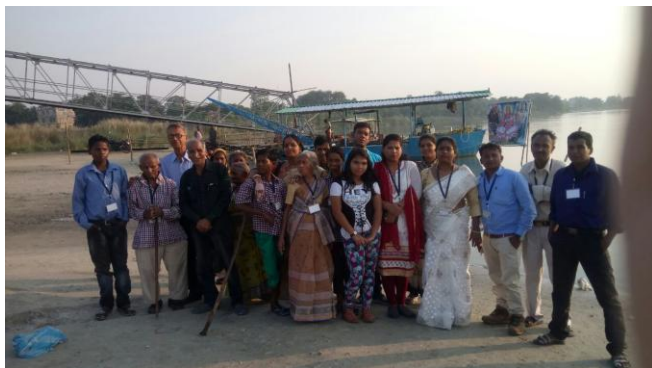
A visit to Mayapur by inmates of Abhayashram