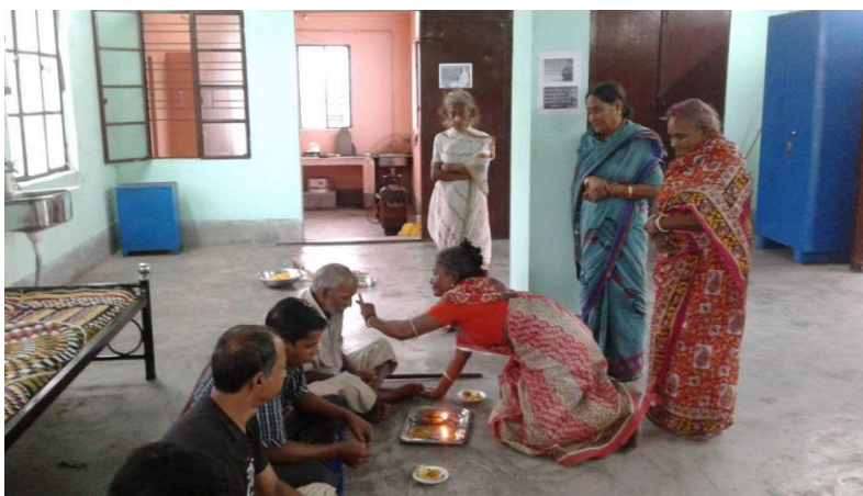
The BHAJ Phota Celebration