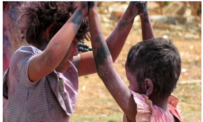
Joyous moment of Holi