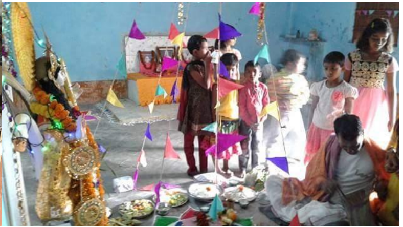
Celebration of swarasti Puja

Now it is time to Pay back something to the society Join us as volunteers to contribute your skill ..